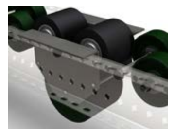
Non-powered indirect mounted brake